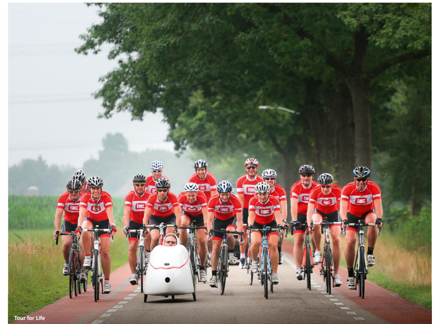
Tour for Life

Thanks to sustained investments in research and development, technological innovation provides a solid basis for the company. In this way IHC also contributes to a sustainable environment.