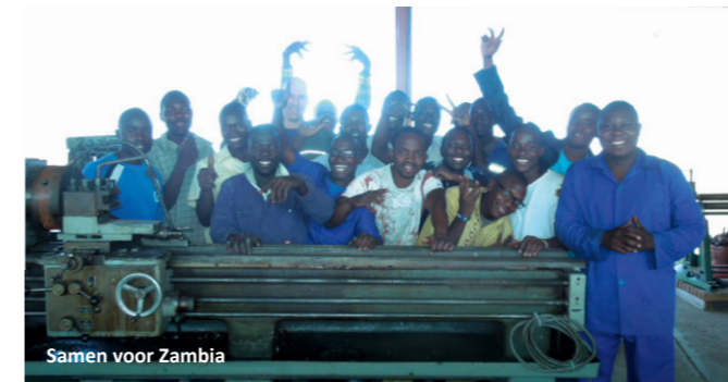
Samen voor Zambia

The assistance provided on behalf of the IHC Merwede Foundation helped to enable the implementation of the Metal Fabrication Course at Chikupi Vocational Centre.